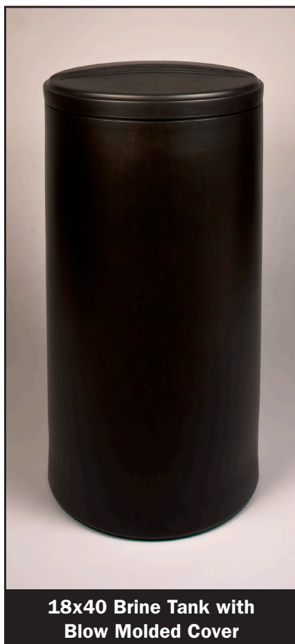
18x40 Brine Tank with Blow Molded Cover